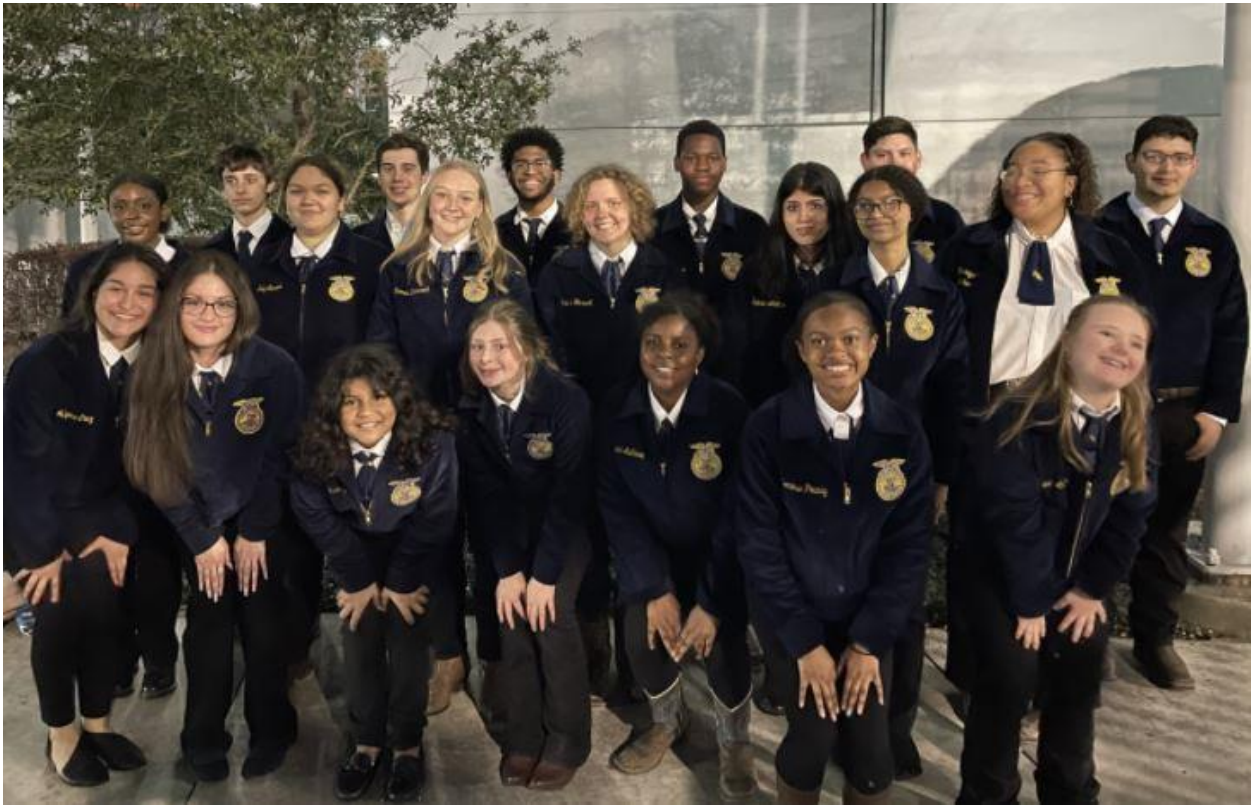
FFA members that participated in the HLSR Program Sales on Monday, March 14 th .