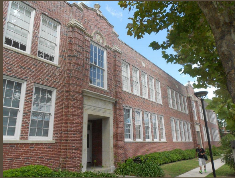
1926 The Gregory School