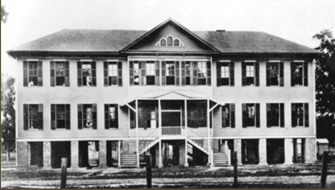
1870 The Gregory Institute