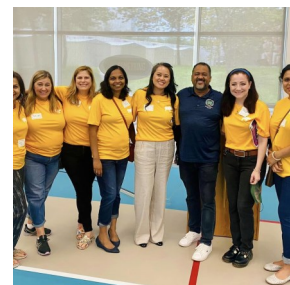
'22'23 PTO Executive Bd